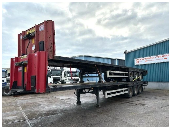
LAG O-3-39 13.60 METER 3-AXLE FLATBED (4 IDENTICAL...