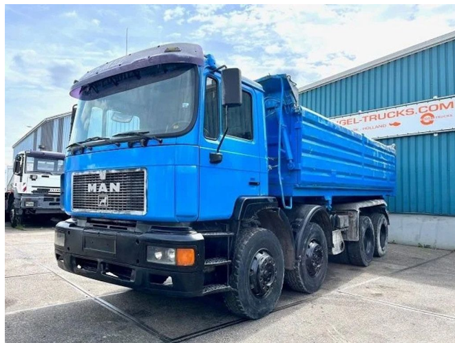
MAN 41.464 F2000 8X4 FULL STEEL KIPPER (EURO 2 / ZF...