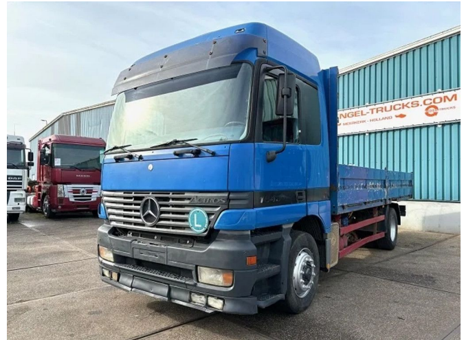
Mercedes-Benz Actros 1840 L (MP1) 4x2 STEEL-AIR SUSP...