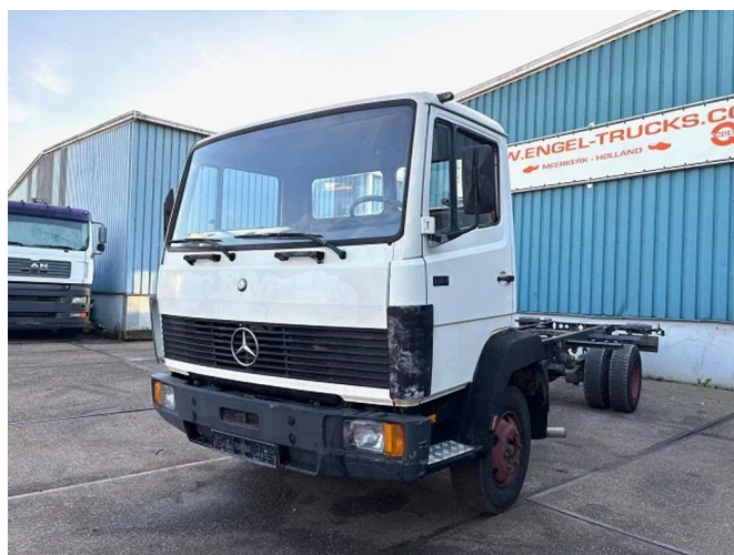
Mercedes-Benz LK 814 6-CILINDER FULL STEEL SUS... 4x2 Referenznummer: SN 57797229