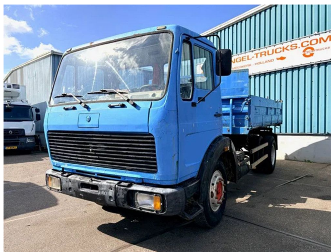
Mercedes-Benz NG 1213K FULL STEEL KIPPER (MA... 4x2