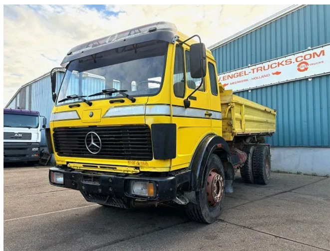
Mercedes-Benz SK 1935 V8 4x2 FULL STEEL 3-WAY MEILL...