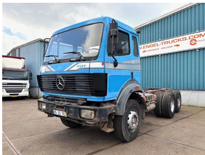
Mercedes-Benz SK 2527 6x4 (V6-ENGINE) FULL STEEL SU...