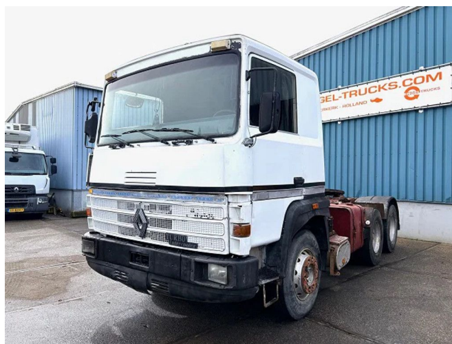
Renault R385 Major 6x4 SPRING SUSPENSION/LAMME (ZF... Referenznummer: SN 59970039 Z