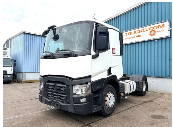
Renault T460 PROTECT SLEEPERCAB (EURO 6 / I-SH... 4x2