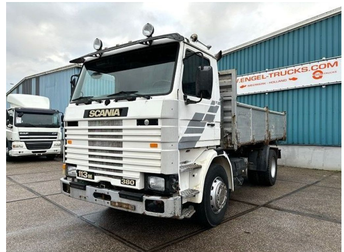
Scania R113-380 H 4X2 MEILLER KIPPER (FULL STEEL SU...