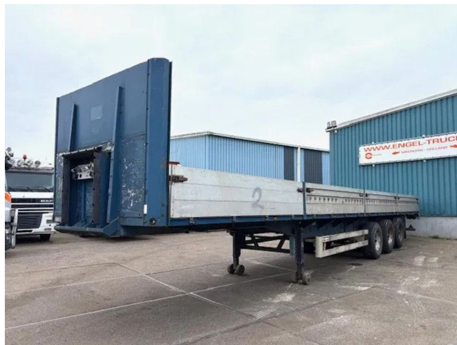
Van Hool 3B1057 3-AXLE 13.60 OPEN TRAILER WITH ALUM...