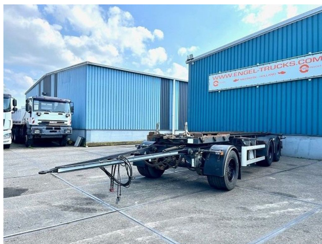
Burg BPA09-18AC 3-AXLE CONTAINER HANGER (SAF AXL...