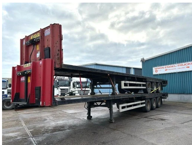
LAG O-3-39 13.60 METER 3-AXLE FLATBED (4 IDENTICAL...