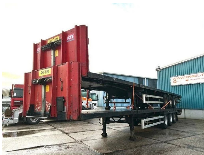
LAG O-3-39 13.60 METER 3-AXLE FLATBED (DRUM BRAK...