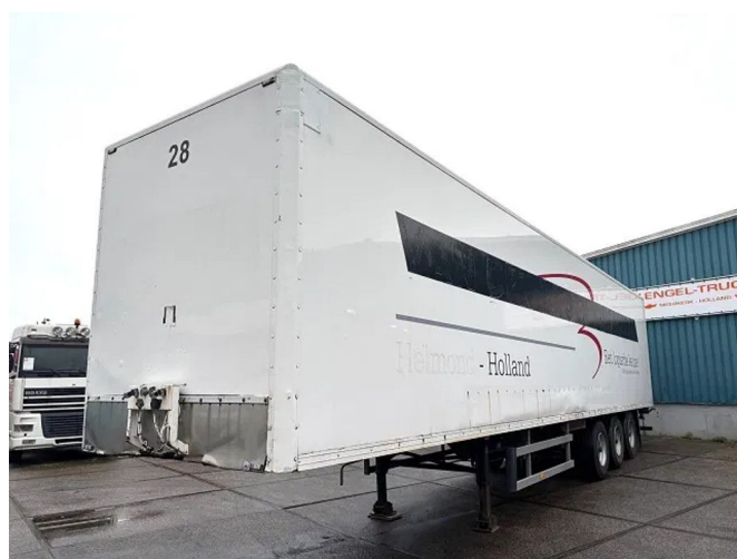
Pacton / JUMBO 3-AXLE CLOSED BOX WITH FULL STEEL ... Referentienummer: SN 56786061