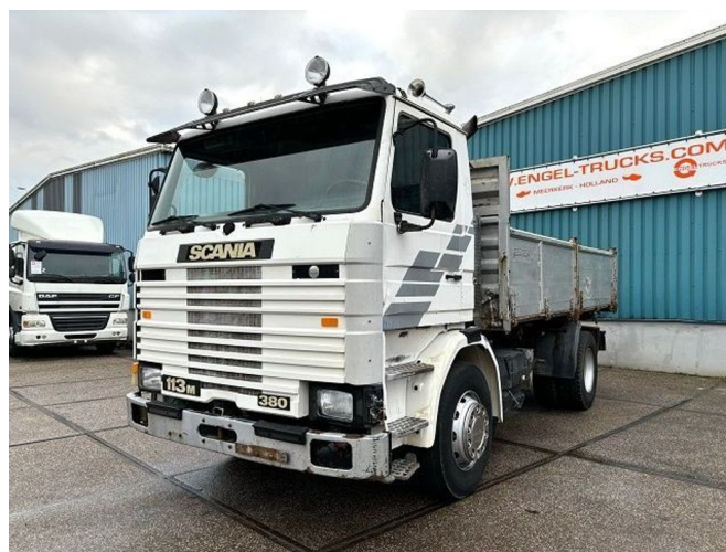
Scania R113-380 H 4X2 MEILLER KIPPER (FULL STEEL SU... Referentienummer: SN 55915961