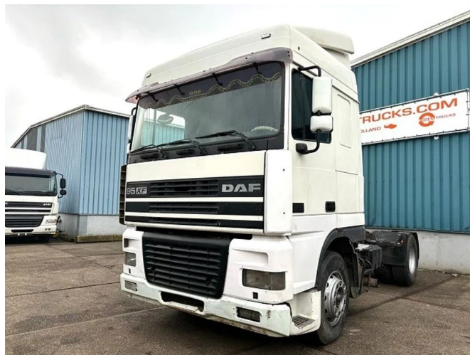
DAF 95.380 XF SPACECAB (EURO 2 (MECHANICAL ... 4x2 Referentienummer: SN 56068266 Z