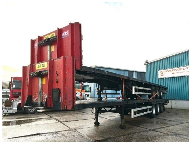
LAG O-3-39 13.60 METER 3-AXLE FLATBED (DRUM BRAK...