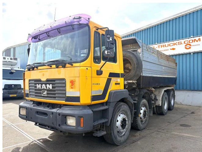
MAN FE 410A 8x4 FULL STEEL KIPPER (ZF16 MANUAL G... Referentienummer: SN 60011696 Z