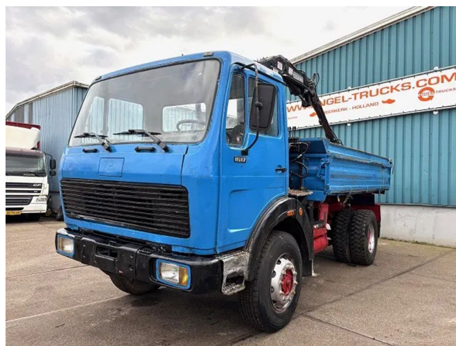
Mercedes-Benz 1617 AK 4x4 MEILLER KIPPER WITH CRA...