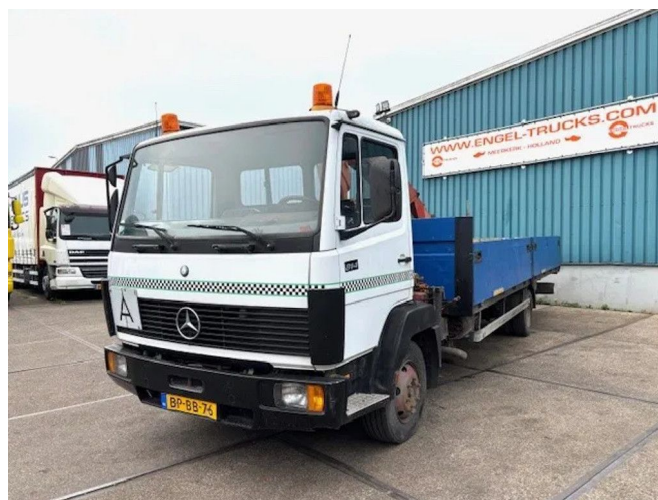
Mercedes-Benz 914 K (ORIGINAL DUTCH) WITH OPE... 4x2