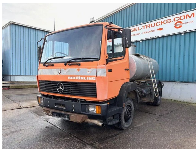
Mercedes-Benz 914 KO RHD 4x2 FULL STEEL TANK TRUCK...