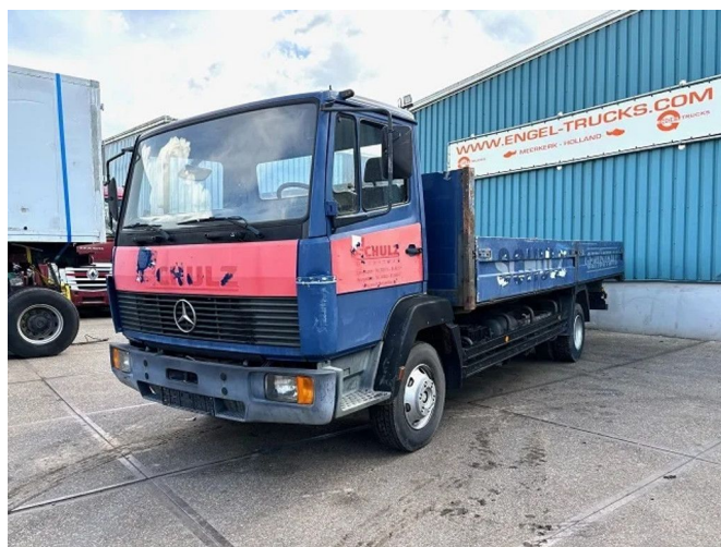
Mercedes-Benz LK 814 (6-CILINDER) FULL STEEL SU... 4x2