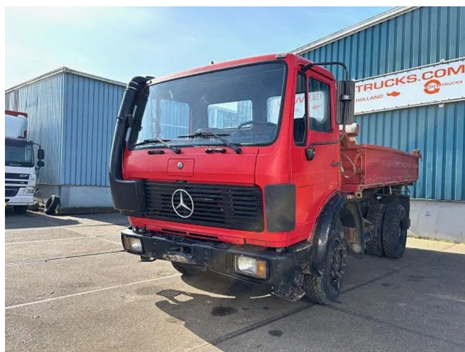
Mercedes-Benz SK 1414K 4x2 3-WAY MEILLER KIPPER (FU... Referentienummer: SN 56575945