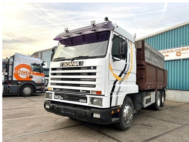
Scania R143-450 V8 STREAMLINE 6x2 FULL STEEL KIPPE... Referentienummer: SN 55639119