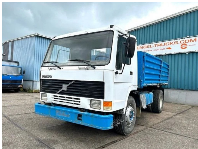
Volvo FL 7-230 4x2 FULL STEEL 3-WAY KIPPER (MECHANICAL PUMP & INJECTORS / MANUAL GEARBOX / FULL STEEL SUSPENSION / HYDRAULIC KIT)