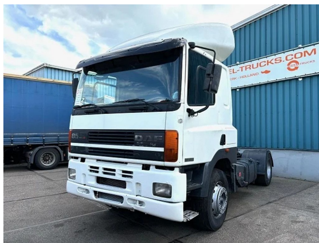
DAF 85.400 ATI SLEEPERCAB (EURO 2 / ZF16 MANU... 4x2