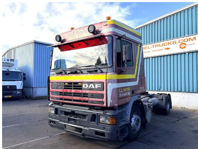
DAF 95.360 ATI SPACECAB (DUTCH TRUCK) (EURO 2... 4x2