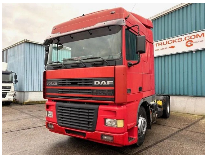
DAF 95.430 XF SPACECAB 4x2 (EURO 2 / ZF16 MANUAL ...