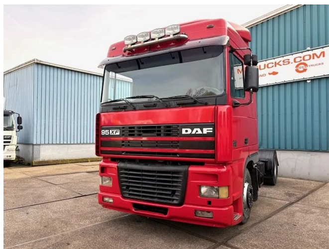
DAF 95.430 XF SPACECAB (EURO 2 / ZF16 MANUAL ... 4x2