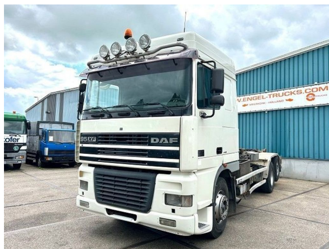
DAF 95.480 XF SPACECAB 6x2 WITH HOOK-ARM SYSTEM...