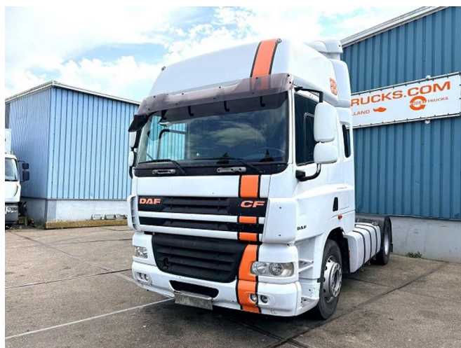
DAF CF 85.410 SPACECAB (EURO 5 / ZF16 MANUAL... 4x2