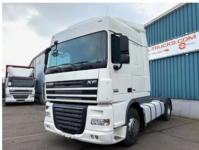
DAF XF 105.460 ATE SPACECAB 4x2 ONLY 835.500 KM (ZF...