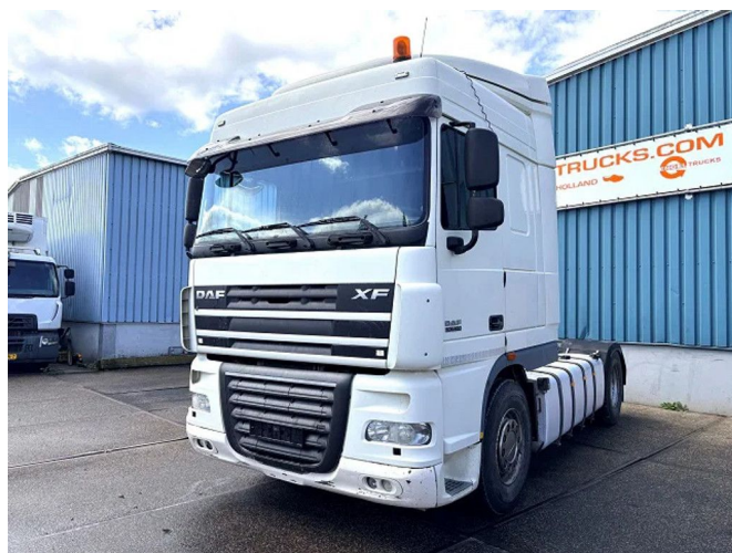
DAF XF 105.460 SPACECAB (EURO 5 / ZF16 MANUA... 4x2