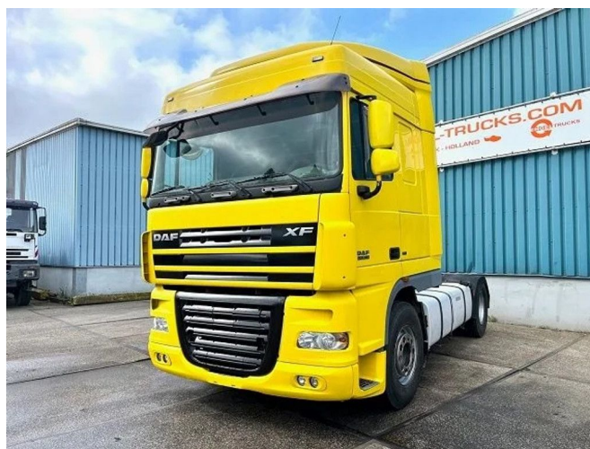
DAF XF 105.460 SPACECAB WITH HYDRAULIC KIT (... 4x2 Referentienummer: SN 54724692