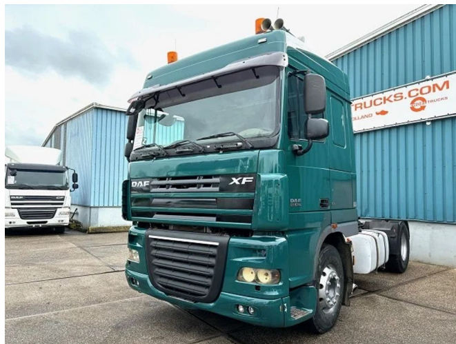
DAF XF 105.460 SPACECAB WITH KIPPER HYDRAUL... 4x2 Referentienummer: SN 54382658 Z