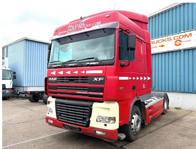
DAF XF 95.480 SPACECAB (EURO 4 / ZF16 MANUAL... 4x2 Referentienummer: SN 60134641 Z