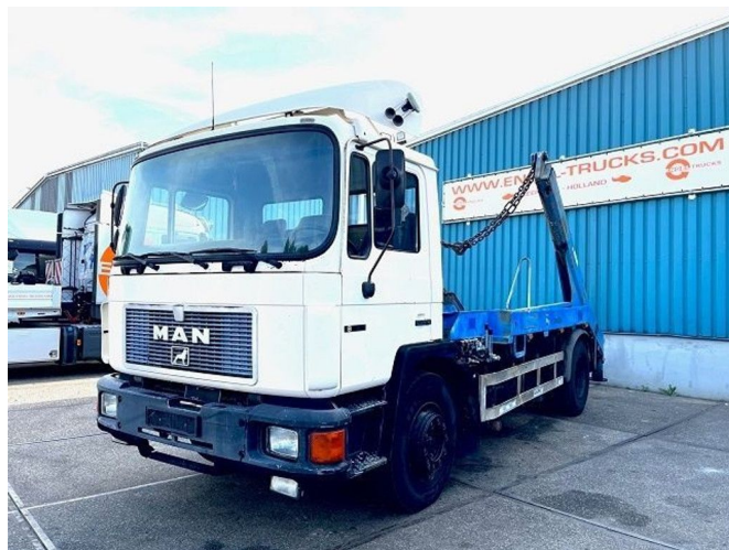
MAN 18 .232 (6 CILINDER) M90 WITH TELESCOPIC ... 4x2