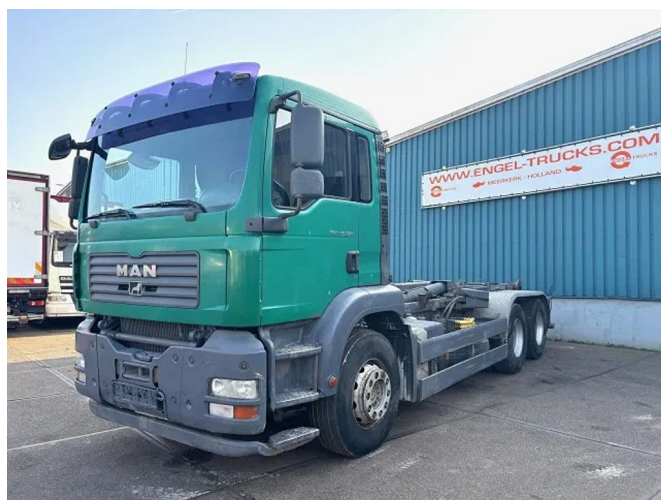
MAN TGA 26.360BB 6x4 FULL STEEL MULTILIFT HOOK-A...