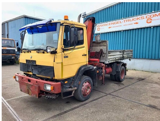
Mercedes-Benz 1117 K (6-CILINDER) KIPPER WITH F... 4x2 Referentienummer: SN 56826116