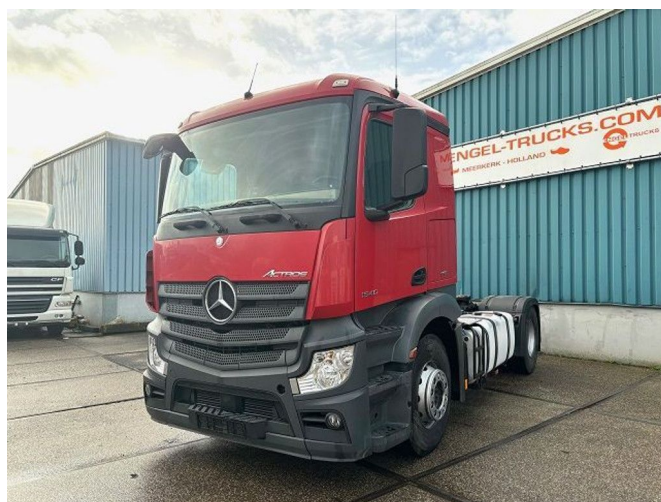
Mercedes-Benz Actros 1840 LS 4x2 SLEEPERCAB (6 IDENT...)