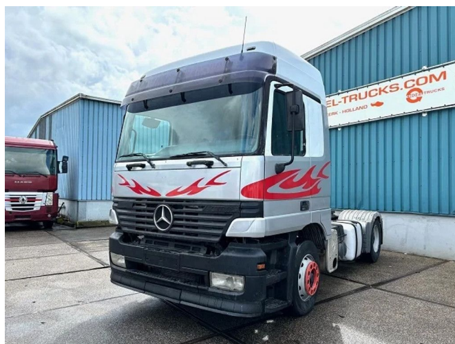
Mercedes-Benz Actros 1843 LS (MP1) (EPS WITH CLU... 4x2 Referentienummer: SN 56350359 Z