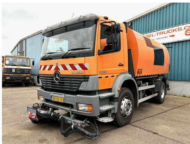
Mercedes-Benz Atego 1828 K RHD (ORIGINAL DUTCH... 4x2