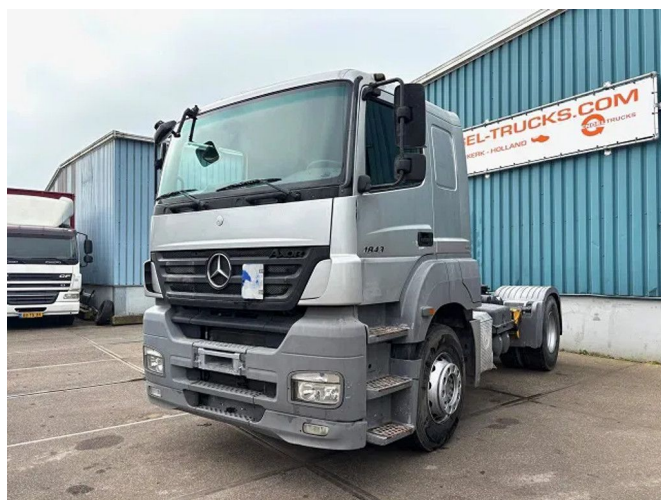
Mercedes-Benz Axor 1843 LS SLEEPERCAB (MANUAL... 4x2