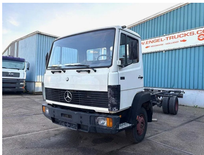
Mercedes-Benz LK 814 6-CILINDER FULL STEEL SUS... 4x2 Referentienummer: SN 57797229