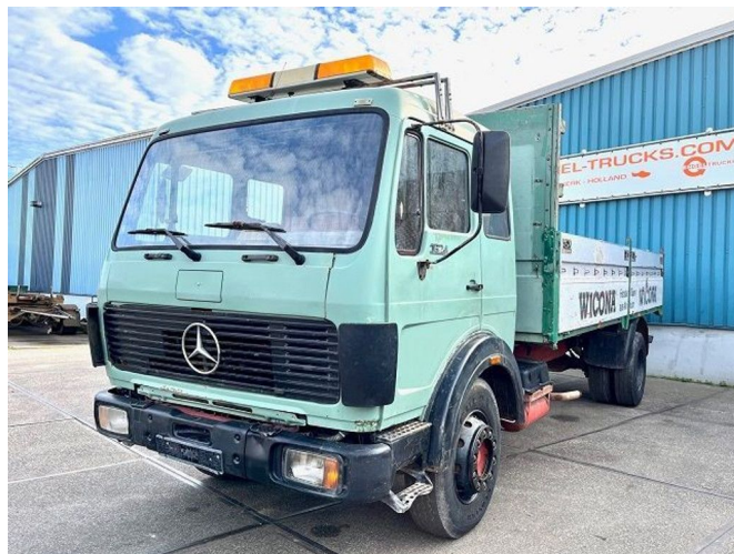
Mercedes-Benz SK 1624 V8 SLEEPERCAB WITH OP... 4x2 Referentienummer: SN 54574025