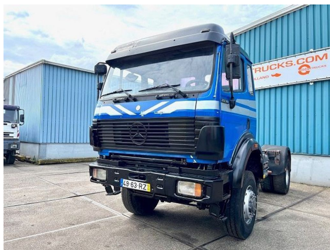
Mercedes-Benz SK 2038 AS V8 4x4 FULL STEEL SUSPENS...