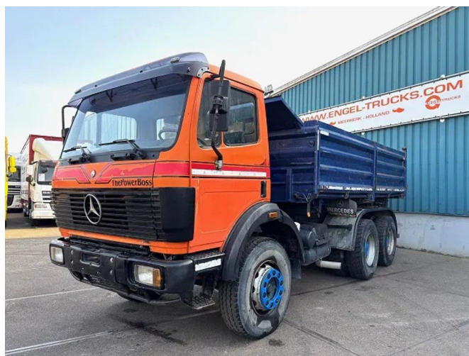
Mercedes-Benz SK 2635 V8 6x4 FULL STEEL MEILLER KIP...