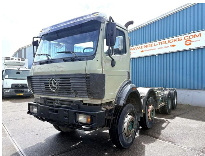
Mercedes-Benz SK 3234 B 8x4 FULL STEEL CHASSIS (V6 ...