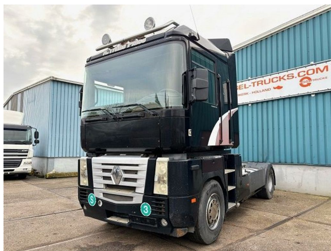
Renault Magnum 480 (E-TECH) PRIVILEGE (ZF16 MA... 4x2